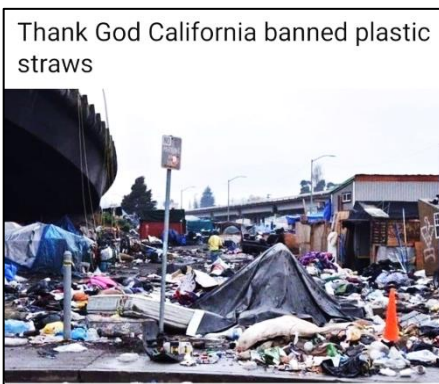
Thank God California banned plastic straws

In response to President Biden's complaint that FOX News doesn't show enough Black and Hispanic people on their network.