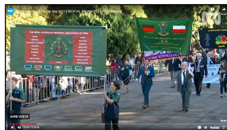
RARA, the Victorian Regiment and Victorian Commando Banners