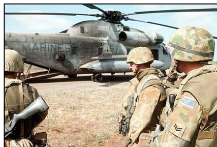
Australian soldiers prepare to board a United States Marine Corps helicopter in Somalia

“After representations from the ex-service community, I have decided to refer the matter to the Tribunal for fresh consideration to look specifically at the issue of unit recognition, particularly whether any units that served in Somalia should now be recognised with a meritorious unit citation for their service.”