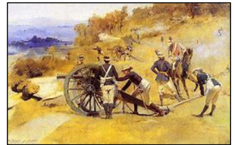
A portrait of A Battery Field Artillery, NSW, 1896 by Tom Roberts

By the end of 1870, as British forces withdrew, the separate colonies of Australia each became responsible for providing its own defence.