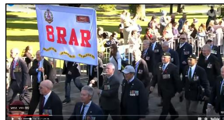
8RAR Banner & members

I think the ABC have done better Anzac Day presentations, I thought it was a rambling narrative with very little information. The ABC cameraman also darted from the march to the RAAF ariel display and when he returned to the march it was not where he left off – sometimes it was difficult to work out which units I was looking at.