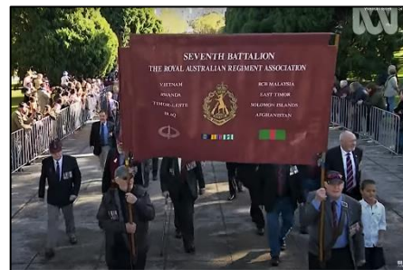
7RAR Banner & members