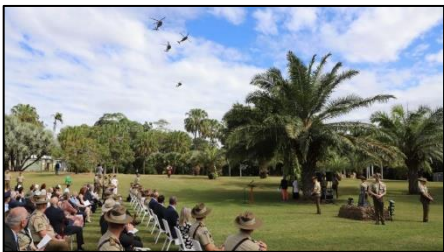
Army soldiers past and present of those killed and several personnel injured in the 1996 Black Hawk helicopter training accident for a commemorative service in Townsville to mark the accident's 25th anniversary.

The Australian Army's 5th Aviation Regiment has commemorated the 25th anniversary of the 1996 Black Hawk accident in Townsville, with a service at The Palmetum in Townsville, including a helicopter formation fly-past.